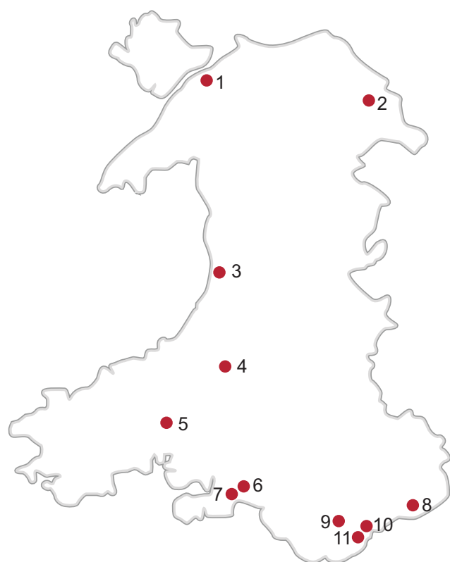
Figure 1 - Location of the 11 Welsh HE institutions

'radical drive towards collaboration and reshaping structures in the sector'. In the light of these challenges, and its desire for the sector to reduce costs and achieve critical mass in teaching and research capacity, the Assembly Government has sought to increase the competitiveness of the HE sector through a policy of supporting greater collaboration between institutions, up to and including merger.